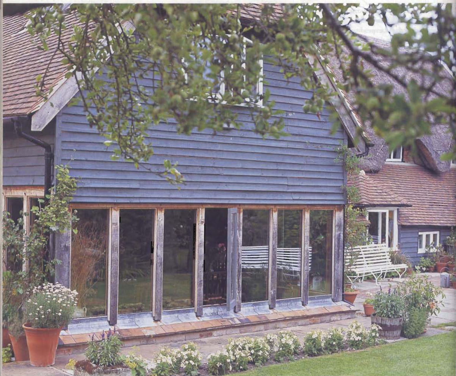
MAIN PICTURE JANE'S ASIATIC PHEASANT CHINA BLENDS WITH THE CHALKY BLUE DINING ROOM WALLS. ABOVE LIGHT FLOODS INTO THE DINING ROOM THROUGH FLOOR-LENGTH WINDOWS

STYLING BY HESTER PAGE/TEXT BY DEBORAH JEFFERY